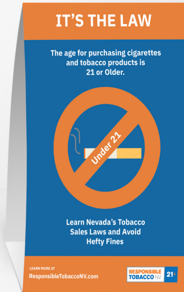
BACK 5.5" X 8.5"